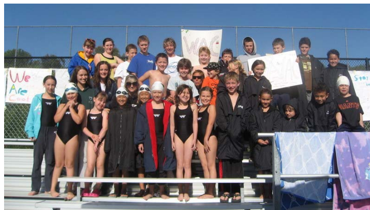
WAC swimmers at the Penguin Meet